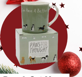
Dog & Cat Mugs R100

★ All these items can be viewed on our online shop page. You can order online or email aro@animalrescue.org.za and orders can be collected from our Charity Shops.