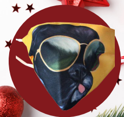
Loopy Masks R100