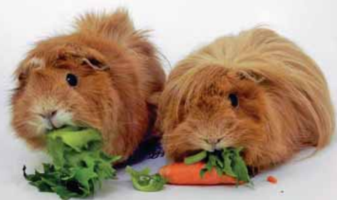
Simon & Victoria

ARO works very hard to find good homes for unwanted and dumped small pets. Please do not purchase pets from pet shops, but do plenty of research into caring for caged pets and adopt from a reputable welfare organisation.